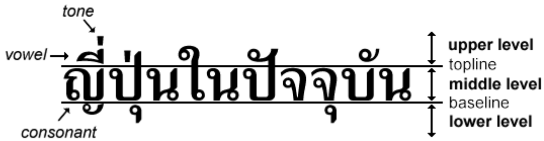
Figure 1. No explicit word delimiter in Thai

which each word is separated from the others by white spaces, this task is comparatively simple. If the tokenized string is not found in the dictionary, it could be an error string or an unknown word. However, for the languages that have no explicit word boundary such as Chinese, Japanese and Thai, this task is much more complicated. Even without errors from OCR, it is difficult to determine word boundary in these languages. The situation gets worse when noises are introduced in the text. The existing approach for correcting the spelling error in the languages that have no word boundary assumes that all substrings in input sentence are error strings, and then tries to correct them [9]. This is computationally expensive since a large portion of the input sentence is correct. The other characteristic of Thai writing system is that we have many levels for placing Thai characters and several characters can occupy more than one level. These characters are easily connected to other characters in the upper or lower level. These connected characters cause difficulties in the process of character segmentation which then cause errors in Thai OCR.