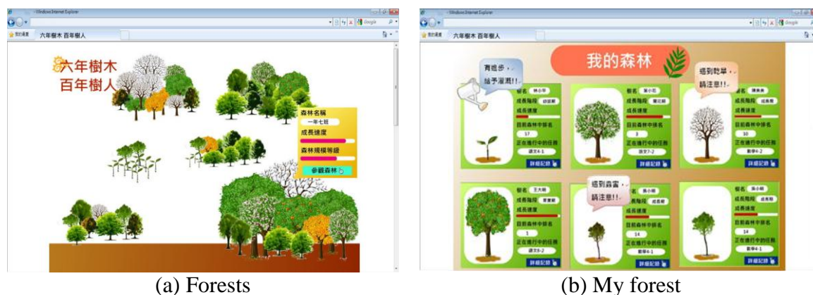
Figure 1: My Teaching Forest

Figure 1(a) shows several forests. Each one represents the whole condition of a class. Teachers can visit other teachers' forests by clicking them, which may show more details. By doing so, they exchange their experiences of managing a forest, or taking care of a class. For connecting the system with six-year elementary education, the authors change the old Chinese saying mentioned earlier into "It takes six years to grow trees but a hundred years to rear people."